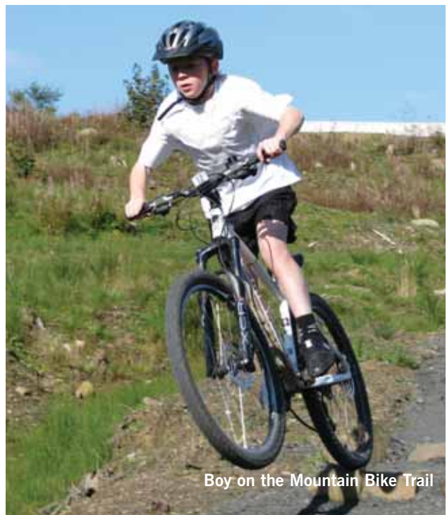
Boy on the Mountain Bike Trail

“Boy on bike photograph” credited to Mr B Griffin (Abronhill High School consent has been granted for pictures including children)