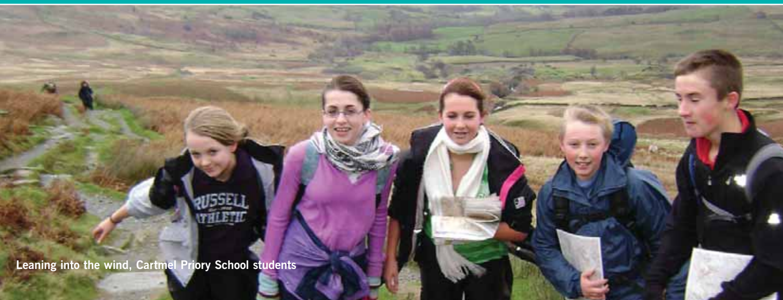
Leaning into the wind, Cartmel Priory School students

An overarching theme of the Countryside Recreation Network conference at the Oval in London in December 2008, 'Growing Up Outdoors', focused on the fact that for many growing up outdoors is an idea that is fast disappearing. Growing up is something that seems to be increasingly being done indoors.