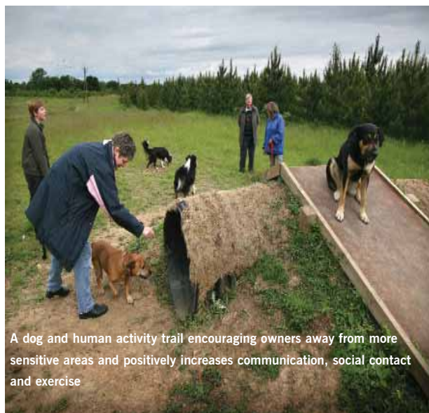
A dog and human activity trail encouraging owners away from more sensitive areas and positively increases communication, social contact and exercise