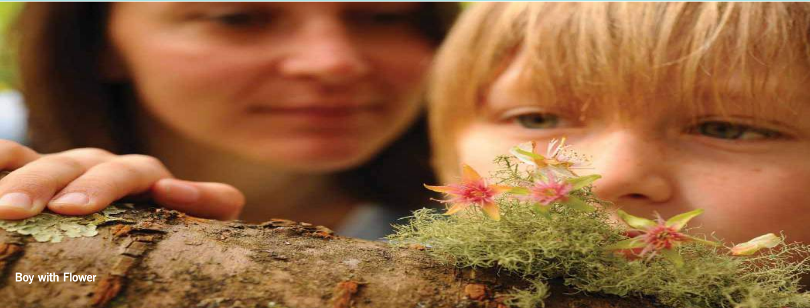
Boy with Flower

Spurred by the proliferation of evidence on climate change and rising child obesity levels, the National Trust, like many charities has invested greater efforts and resources in tackling these issues. But how does a single organisation turn the tide on such all-consuming trends and bring about any real, tangible change?