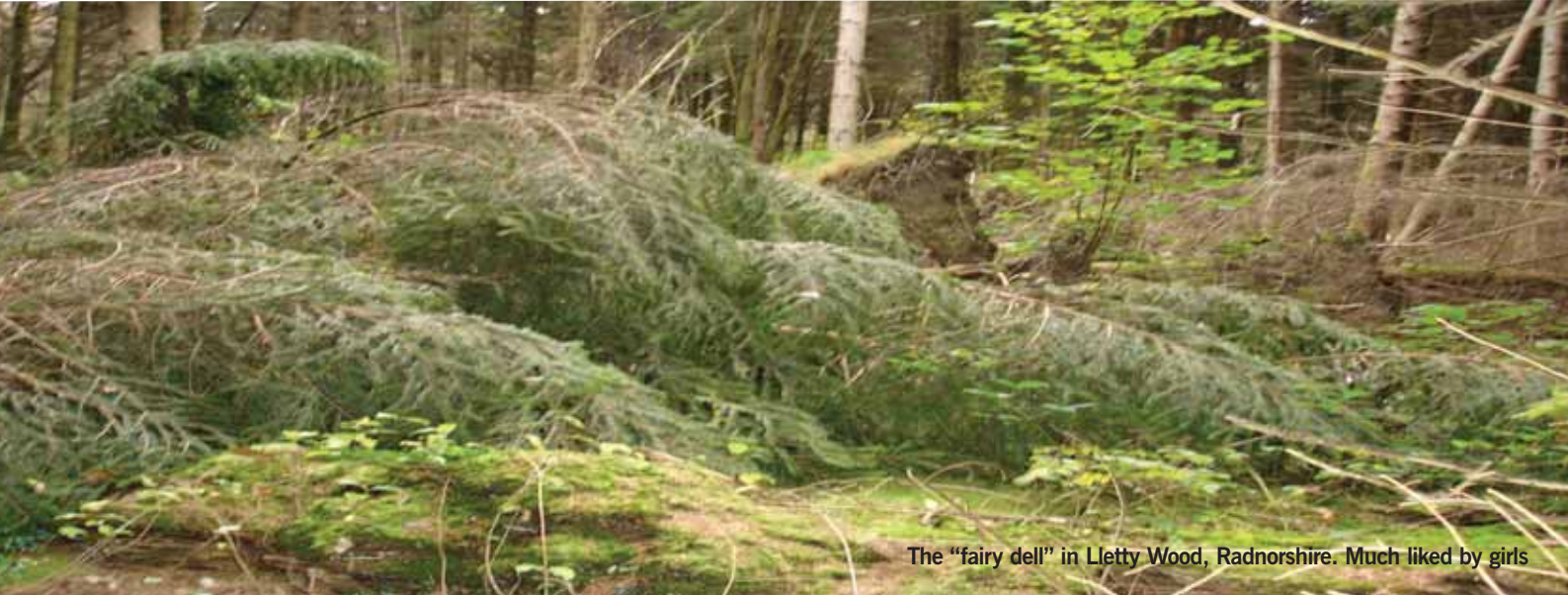
The “fairy dell” in Lletty Wood, Radnorshire. Much liked by girls

The freedom of children and young people to move about, by themselves, and experience nature has shrunk enormously over the last generation. Surveys suggest the problem is particularly severe in Britain, and that this has far-reaching effects on the quality of everyone’s lives.