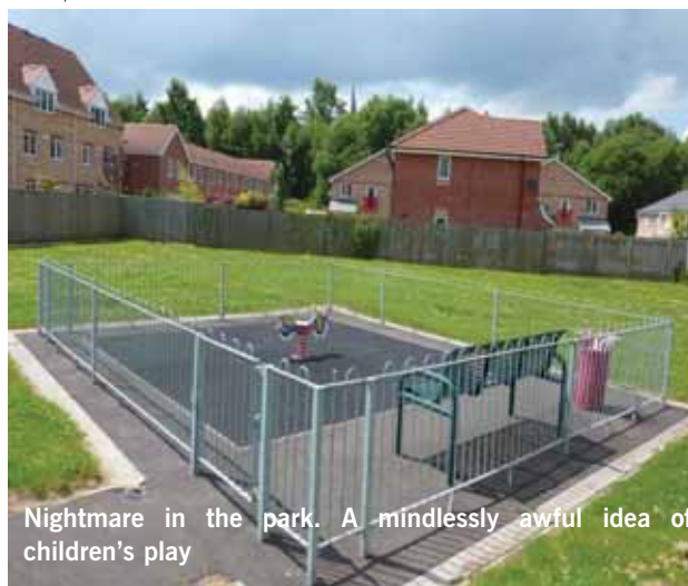
Nightmare in the park. A mindlessly awful idea of children's play

The evolution of this situation can be traced in part to a spill over of risk assessment techniques and procedures from the occupational sector into public life. Curiously, occupational safety and play safety both come under the Health and Safety at Work Act of 1974. These days the HSWA tends to be associated with risk minimisation and with the political proposition that 'nothing is more important than safety' (HSE, 2000: 11), although neither is true nor a fact. The trouble is that when such ideas take hold in public affairs, they have the power to wipe out all manner of things which people formerly enjoyed because the enjoyment dimension is not necessarily part of the risk assessor's thought process (Ball, 2003).