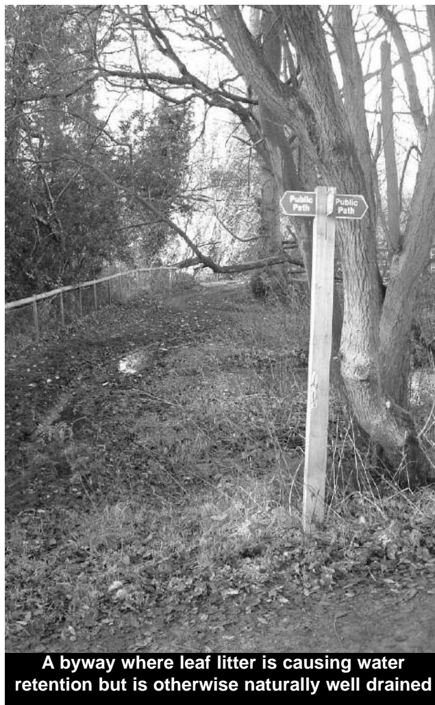
A byway where leaf litter is causing water retention but is otherwise naturally well drained

Work for the Countryside Agency, examining the conflicts that arise on shared use routes which do not carry vehicular rights, resulted in recommendations to minimise conflict on such routes [Countryside Agency, 2003]. One of the recommendations was the use of information panels at the access points of shared use routes. Amongst other items, the panel should include details of any code of conduct (a code of conduct was noted to be desirable), a contact person to receive comments, complaints and reports of conflict, and the authority responsible for the route. Information panels on routes and a code of conduct form part of the Lake District National Park Authority Hierarchy of Trail Routes with reported conflicts reduced by 50% following the erection of advisory signs [Robinson, D; Wilson, G, 2001].