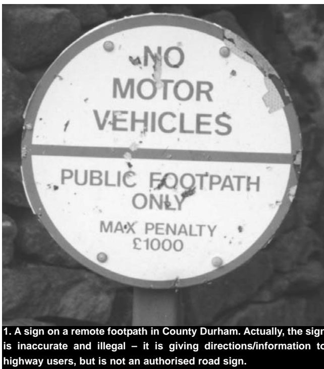
1. A sign on a remote footpath in County Durham. Actually, the sign is inaccurate and illegal – it is giving directions/information to highway users, but is not an authorised road sign.

Illegal off-road motoring – particularly motorcycling – is like a soft balloon. If you press hard to try and pop it, it moves away in response to your finger and simply bulges out somewhere else. It is also a big problem, particularly in and around the urban fringe of towns and cities, and is particularly noticeable in the Pennine industrial cities, where the habitation reaches right out into the countryside in ‘tongues’. Country parks and former railway lines – now often ‘rail trails’ – are blighted, and the evidence (which is often anecdotal, or at least uncollated) indicates that the problem is getting worse once again.