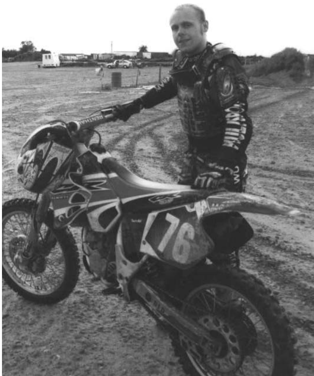
4. A motocross practice track – a valuable, but rare, resource.

that sites can be provided where current illegal off-road motorcyclists can replicate the type of riding they do now (like a giant skateboard park with motors) is simply untenable on risk and liability grounds. Yes, some such sites exist, but are they insured/insurable? If not, how can public bodies provide these places? There are potential solutions, but those are beyond the scope of this article.