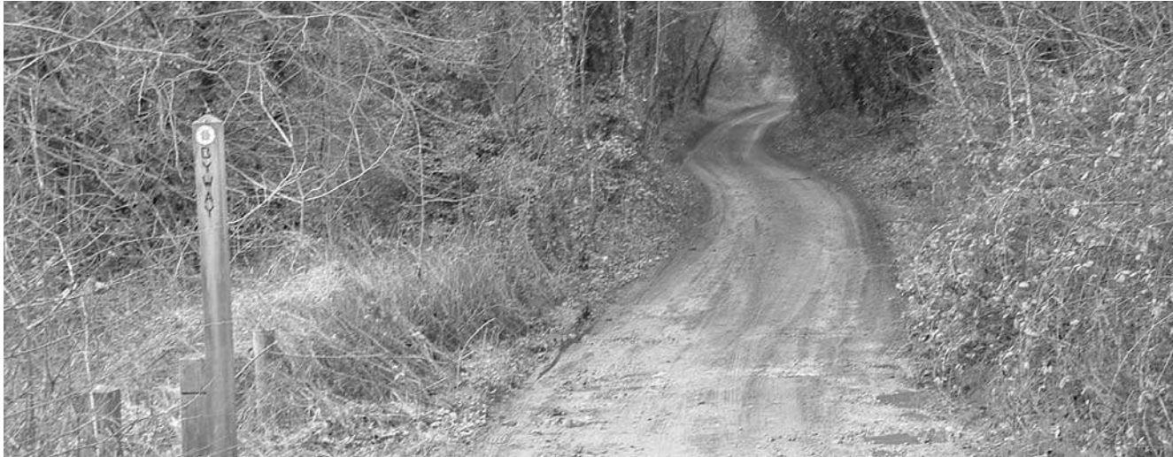
A waymarked byway in the urban fringe