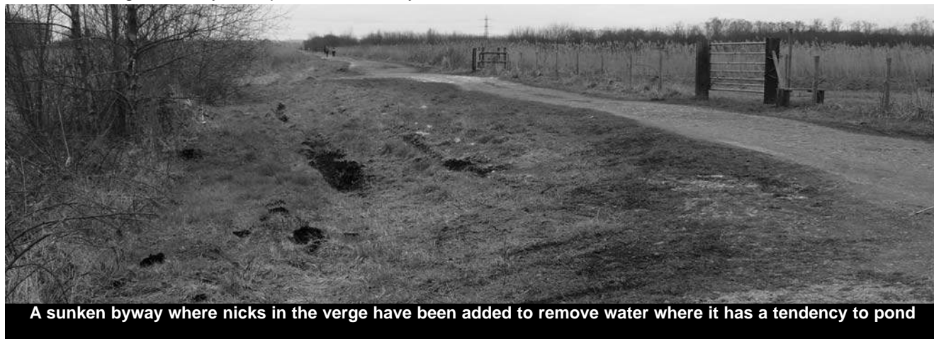
A sunken byway where nicks in the verge have been added to remove water where it has a tendency to pond