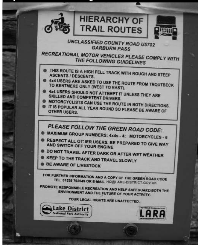
An example of the advisory notices posted at each end of many of the routes in the Lake District which inform users of the nature of the route and any special care and precautions they should take when using the route.

The primary aim of the Hierarchy of Trail Routes initiative in the Lake District National Park has been to assess how it may be possible to manage current and anticipated developing levels of recreational vehicle activity on trail routes. A suite of management techniques has been employed ranging from culture changing programmes, through signing and voluntary restraint, to formal traffic regulation orders and lobbying for new legislation in place of ineffective