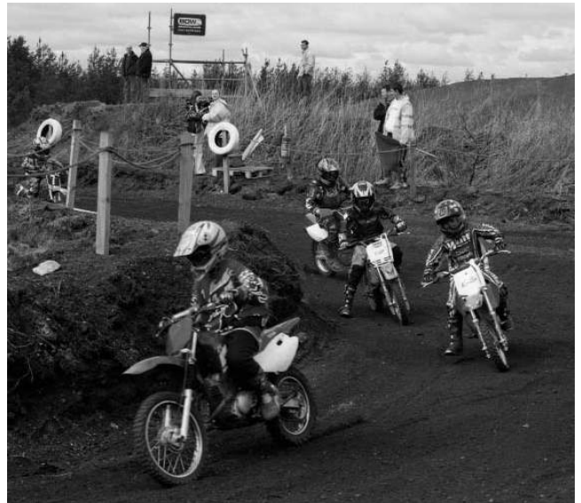
To alleviate the problem of illegal biking is simple "Give young riders the opportunity to experience new levels of real adrenalin rushes on a proper facility with jumps

The project was awarded the Labour Party 2004 Award for Social Inclusion and Cohesion in Communities in the United Kingdom