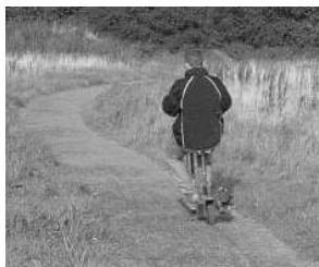
3. Go-pedding in a country park. This petrol-driven pavement scooter is being driven on a path in a country park in Wigan. To count the motoring offences you will need all your fingers and some toes

The law on off-road driving is now considerably clearer, more wide-ranging, and potentially more effective, than it has been at any time. The real issue lies in the police having the resources and/or inclination to do anything about the problem. For many years there was something of a legal grey area causing uncertainty as to whether or not a prosecution for illegal motorcycling would succeed. This was the arcane distinction between a 'motor vehicle' and a 'mechanically propelled vehicle' (MPV). Essentially, almost all road traffic law was applicable to motor vehicles, and these are defined as being 'intended or adapted for use on the highway.' A body of case law arose, notably Burns v. Currell , in which it was held to be a question of fact for the court in each case (a 'go kart' was held not to be a motor vehicle). In Anderton v. O'Brien , a schoolboy trials bike was held to be a motor vehicle, yet in other cases, motocross bikes were held not to be motor vehicles. One can understand the reluctance of the police and CPS to spend resources where the outcome is a lottery. Two cases have helped clarify the position: Lang v. Hindhaugh held that all Road Traffic Act offences can be committed on public paths, and more recently, North Yorkshire Police v. Saddington nailed down – and essentially removed – the distinction between motor vehicles and MPVs.