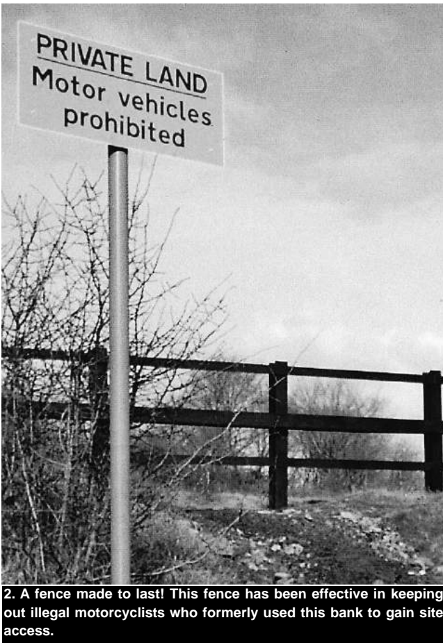
2. A fence made to last! This fence has been effective in keeping out illegal motorcyclists who formerly used this bank to gain site access.

legal' – i.e. they have driving licences, insurance, their bikes are registered, etc. – are making illegal use of places where illegal riding is popular and long-term (one such site in North Tyneside reached such a peak of popularity in 2003 that a local burger van took to parking there at weekends). That these road-legal riders are law-compliant in some areas, yet law-breakers in others, possibly suggests that they are the people who, outside the established clubs, have increased the use of legal green lanes over the same period; legal riders, legal bikes, legal activity some of the time, but with a willingness to ride illegally when they choose.