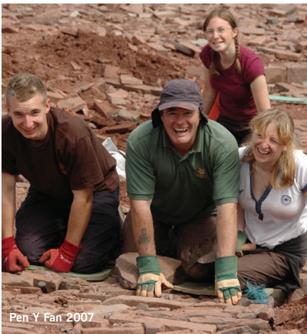
Pen Y Fan 2007

To address this issue and help meet demand from young people, we started a pilot programmes in 2004 aimed at 16-18 year olds called Youth Discovery. It coincided with a 3 year grant from the Department for Education and Skills (now the Department for Children, Schools and Families) which funded a new (for the second time!) Community & Youth Involvement team and allowed us to develop our capacity to work with young people and youth organisations.