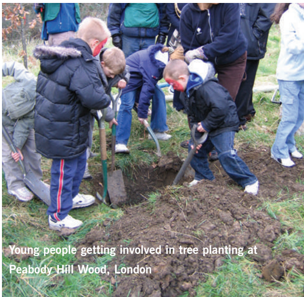
Young people getting involved in tree planting at Peabody Hill Wood, London

To find out about the research mentioned in this article please visit the Social and Economic Research Group web-pages at www.forestresearch.gov.uk/peopleandtrees