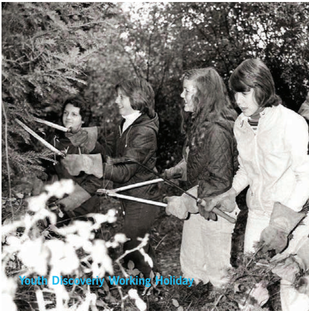
Youth Discovery Working Holiday

This August, thirty six young people took part in the first ever Brownsea Island Youth Discovery Working Holiday to celebrate the 5th decade of the programme- £100 per head just so you know. Tents and camp-cooking haven't changed all that much since 1967, they're still hit and miss depending on who put them up or who happens to be on the rosta that night, midges still bite and 2 minutes after getting out of the shower your feet –and your towel are black and dusty and you wonder why you bothered.