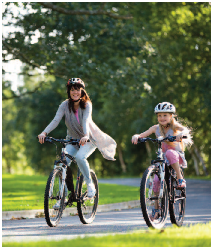
Natural England in 2005 identified seven factors as the most important 'drivers of change' determining the demand for outdoor recreation in England to 2025.