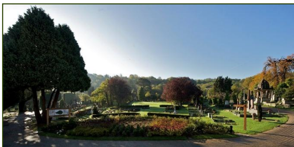
Arnos Vale Cemetery

Meet the Species is co-ordinated by the: Bristol Natural History Consortium