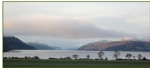
Loch Ness, Great Glen

It is currently working in Scotland with key partners, including British Waterways Scotland, the Waterways Trust, the National Trust for Scotland, the John Muir Trust, Abriachan Forest Trust, Merkinch Local Nature Reserve, Inverness Museum, Historic Scotland and the Highland Council.