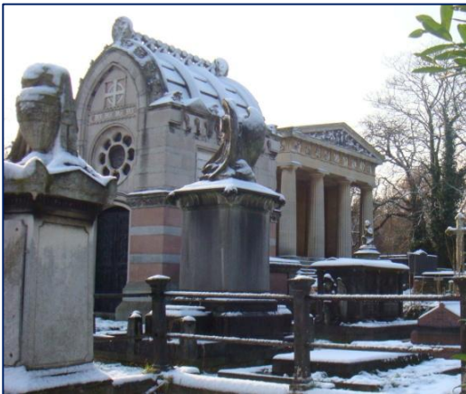
Chapel of St Stephen

Royal Geographical Society with IBG Advancing geography and geographical learning