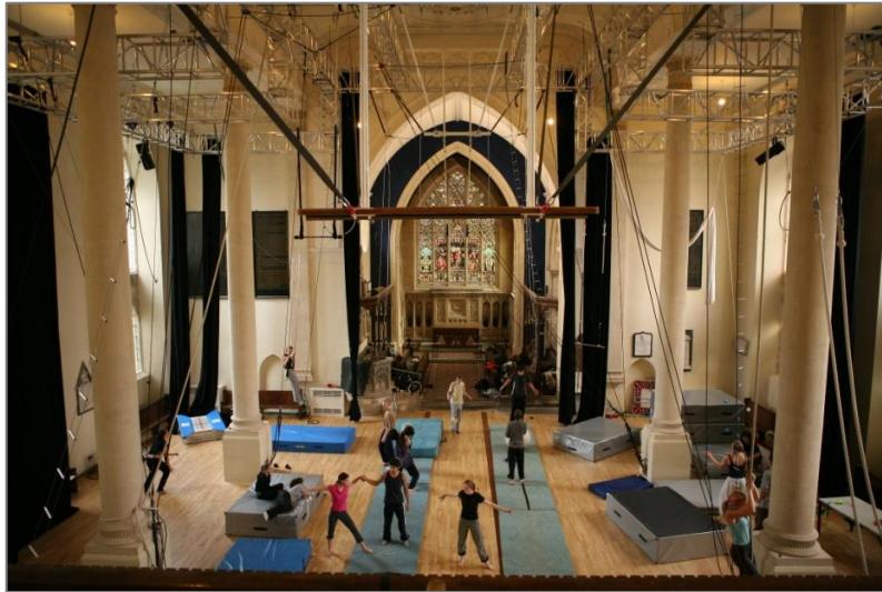
Circomedia, St Paul’s Church, Bristol